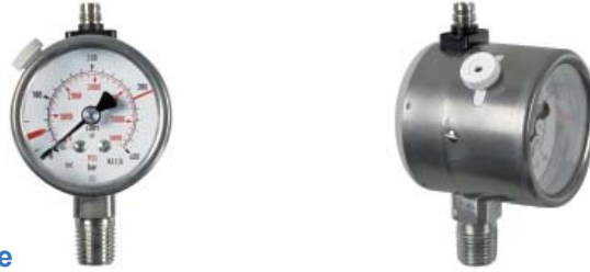
Reed contact pressure gauge