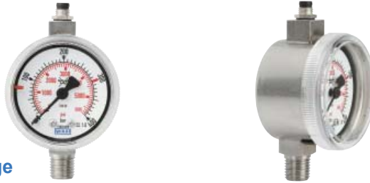
Reed contact pressure gauge