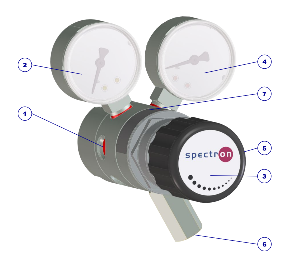
Illustration 1: Pressure regulator design M53

The design described is an example. The product design may vary depending on the configuration.