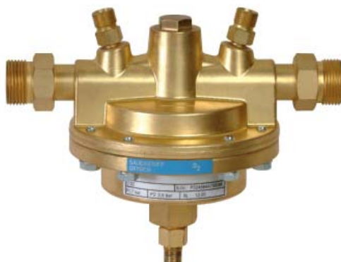
Pressure regulator U22 E - G 1 m