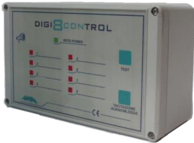
Alarm unit with 4 or 8 digital inputs